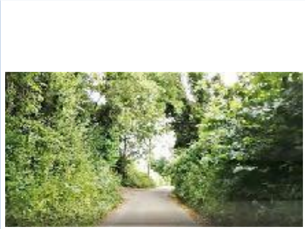
12. At corner of Hog Lane and Hunt's Lane, across (133) to open countryside and up and down the hollow-way (Hunt's Lane)