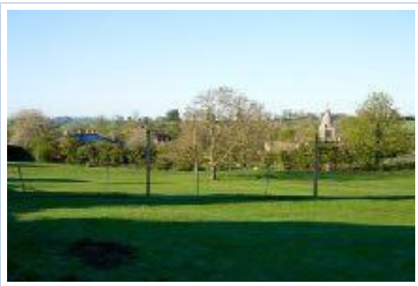
10. From North End, south over (130) open space to Hog Lane and allotments