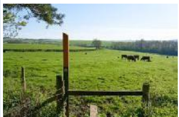
4. From the edge of the built-up area across (123) to the hills to the east