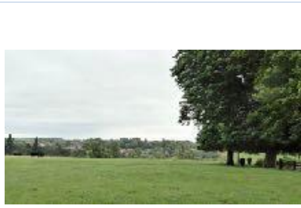
9. From the top of Hare Pie Bank (160) over and into the village. This is the key view for describing the village in its setting.