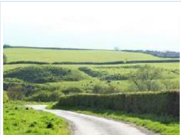
6. From the hilltop down the sweeping curve of Goadby Lane to Hallaton Castle motte and bailey earthworks (Scheduled Monument)