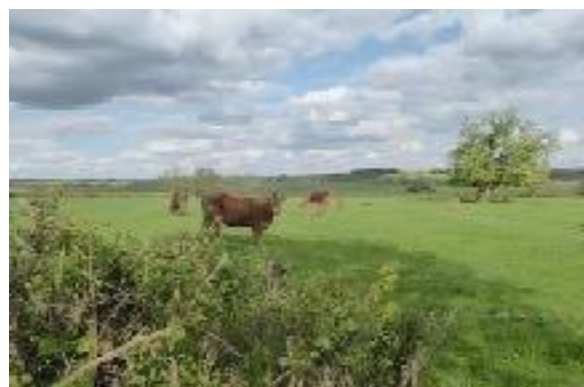
3. Across Goodmans field (122) into the narrow valley of Horningwell brook