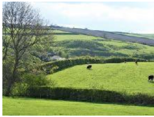
7. From the corner of the cemetery (138) to Hallaton Castle motte and bailey earthworks (Scheduled Monument)