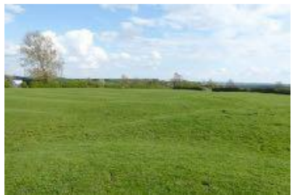
2. From Mill Mound (106): extensive sweeping views south over village, east and west to distant hills