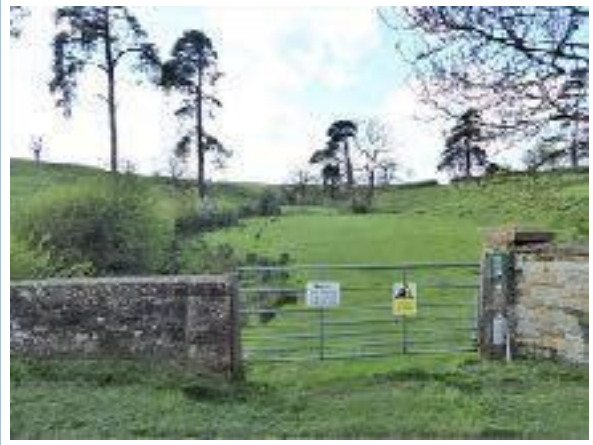
8. From the Church Bridge over Hallaton Brook at the bottom of Hare Pie Bank, west along the brook and drift valley. (143)