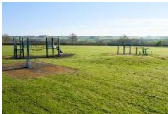
1. From recreation ground (inventory reference 116): panorama looking northeast to southeast over deep valley of the Horningwell brook toward the hills to the east