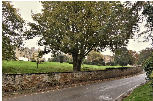
16, the iconic view of the Old Rectory and St Michael's and All Angels Church when entering from the south via Church Hill.