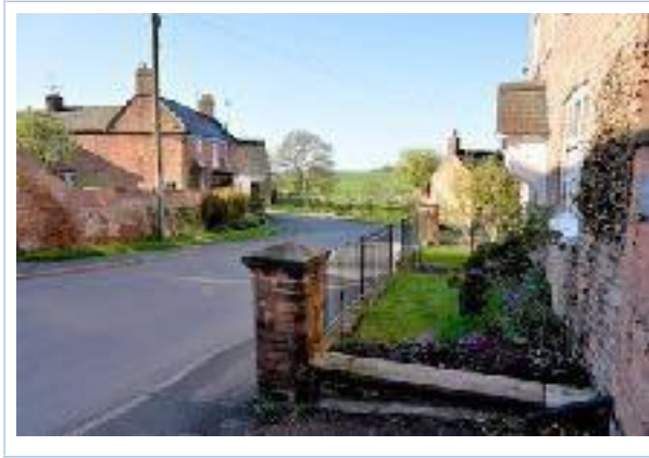
13. South down Eastgate to the road junction and through the gap between houses into open countryside (165)