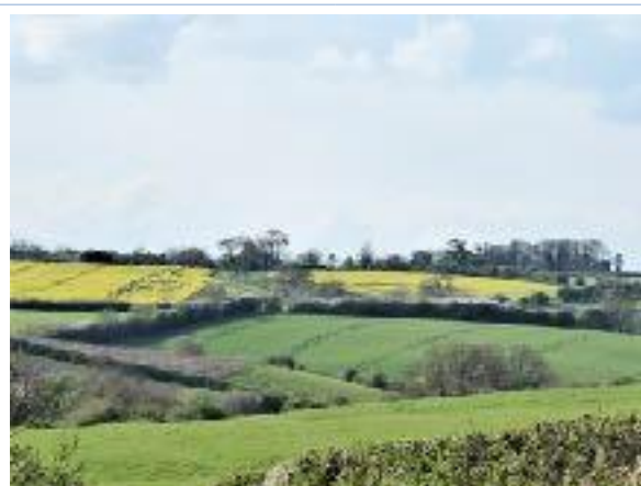
5. From the corner on Goadby Lane west down the hillside into the valley of Hallaton Brook (100)