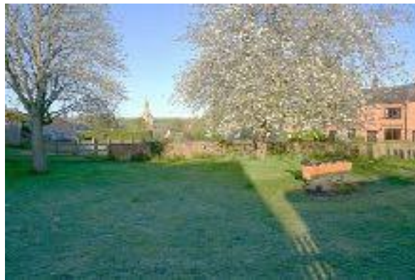
14. View South from Hog Lane toward the Church. (187)