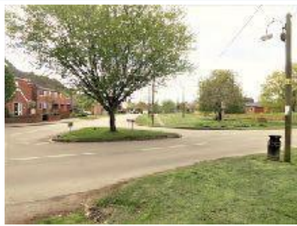
11. From the small 'village green' opposite the Fox PH, west along North End (129)